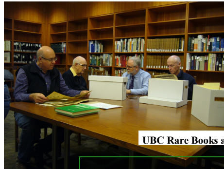
UBC Rare Books and Special Collections