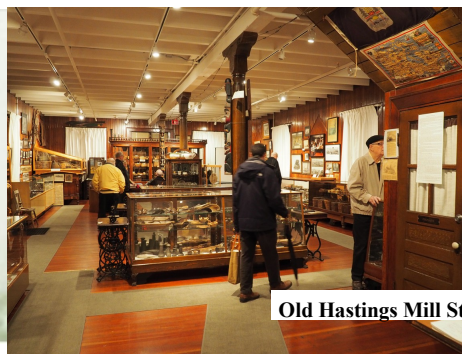
Old Hastings Mill Store Museum